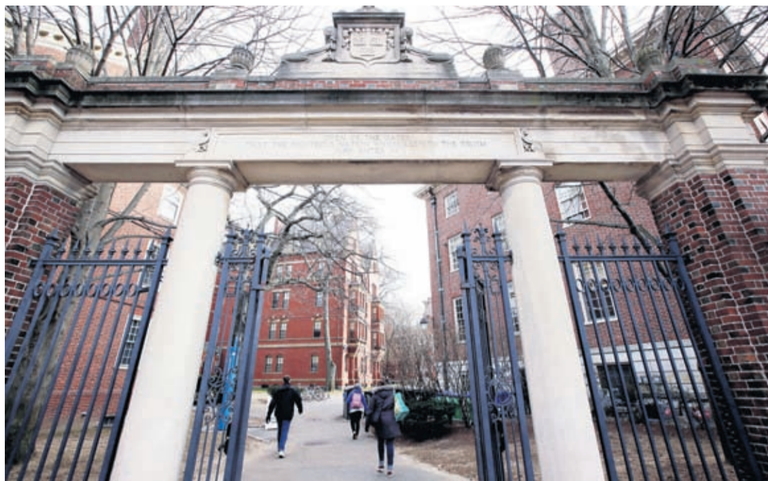
People walk through the gates leading to Harvard Yard, Dec. 13, 2018, at Harvard University in Cambridge, Mass.